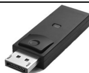
DisplayPort to HDMI w/ LED Model 102027

Customer Support and Contact Information Cable Matters offers lifetime technical support as an integral part of our commitment to provide industry leading solutions.