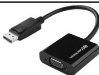
DisplayPort to VGA Model 102006