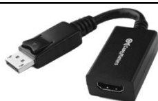
DisplayPort to HDMI Model 102018

View our other DisplayPort Adapter products at www.cablematters.com